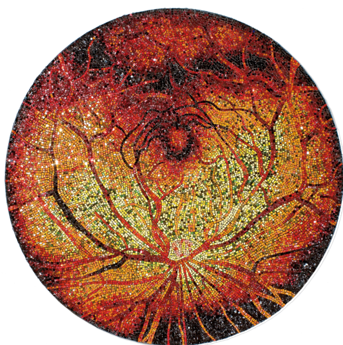
Oculus Dei 180 cm diameter Glass and mosaic Permanent installation at the College of Law, FIU Miami 2002