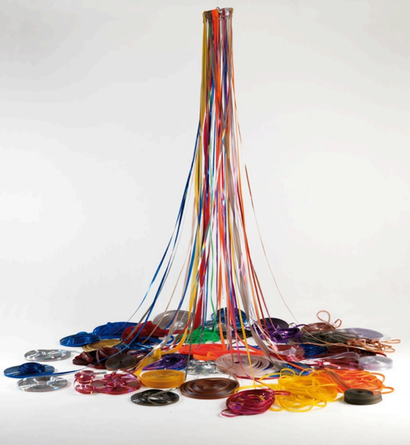
Waterfall PVC Variable Dimensions Pavilion Paradise, Venezia 2009