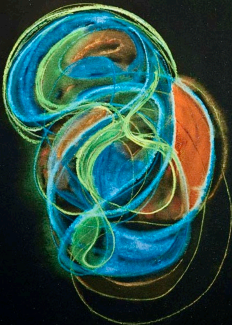
Tango 134 x 184 x 6 cm Mixed media on canvas 2011