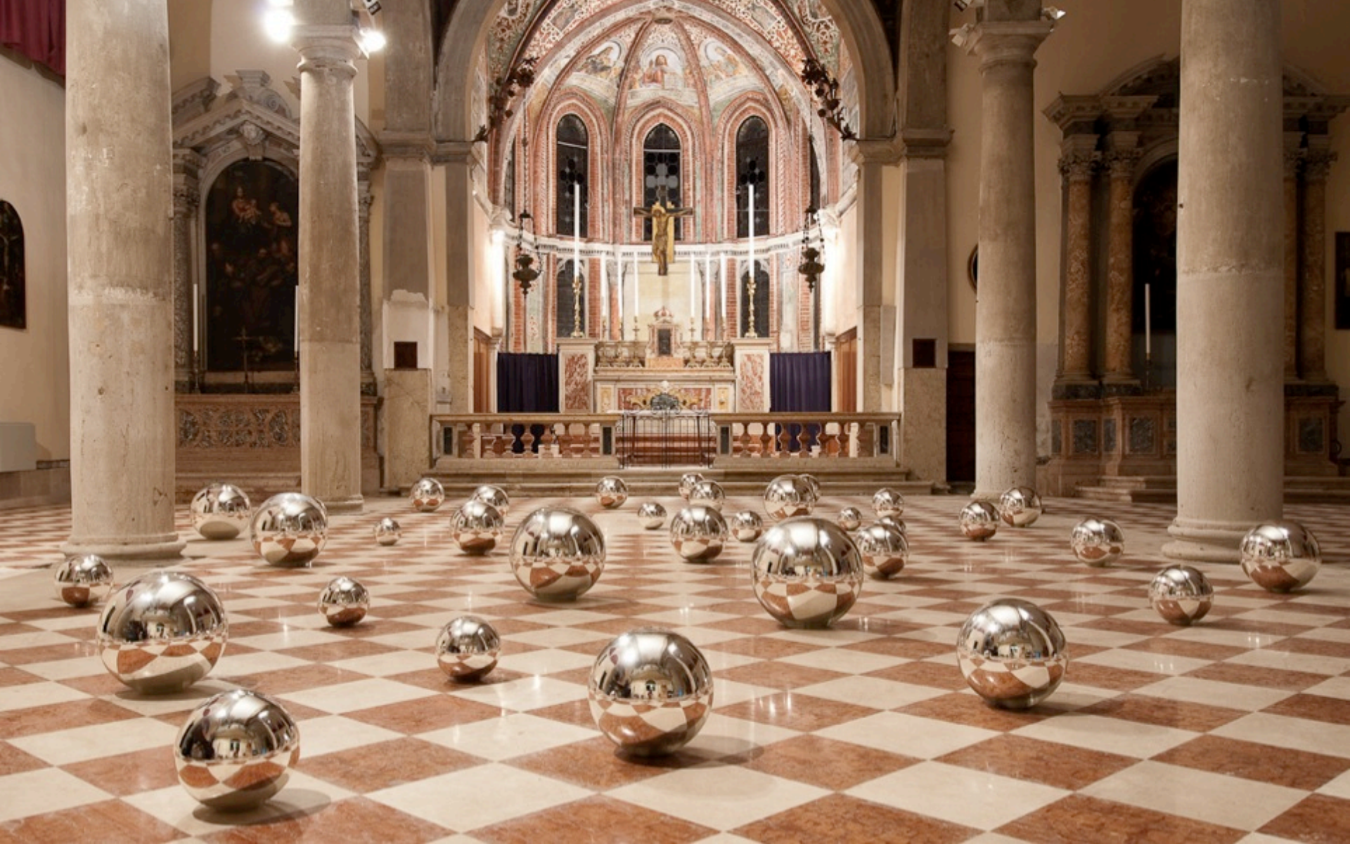
Le Sapienze installation Murano glass Venezia 2009