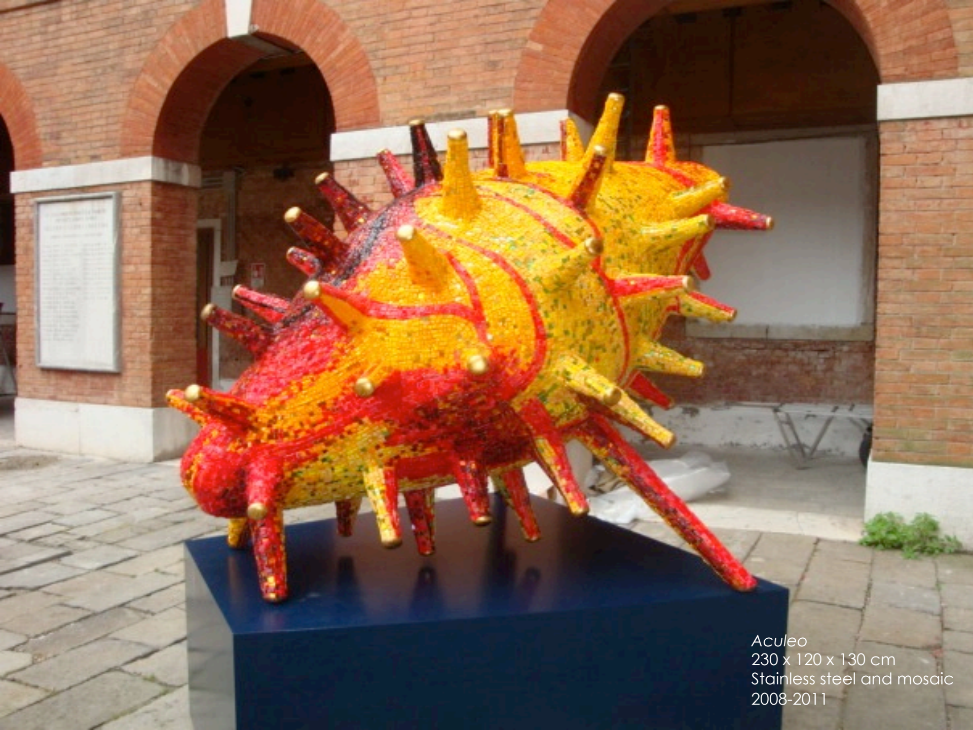
Aculeo 230 x 120 x 130 cm Stainless steel and mosaic 2008-2011