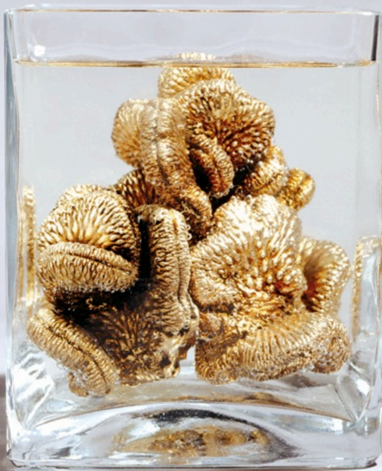
The Garden of Thoughts detail 22 x 16 x 22 cm Oil, glass and bronze 2001