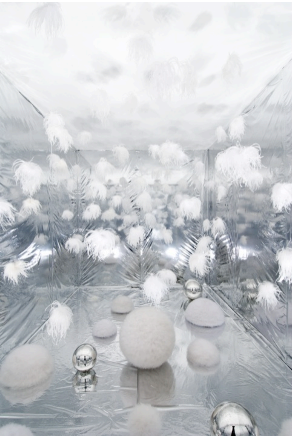
Follow the White Street of your Heart installation Mixed media 11 x 3 x 3 metres 2004