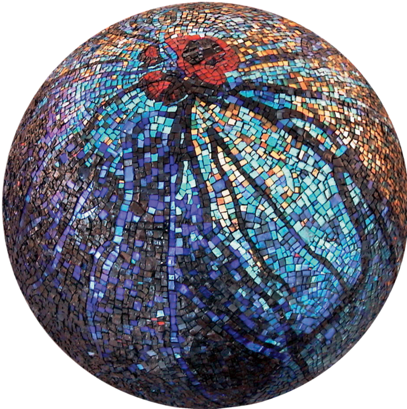
Moon of my Eyes 100 cm diameter Mosaic 2002