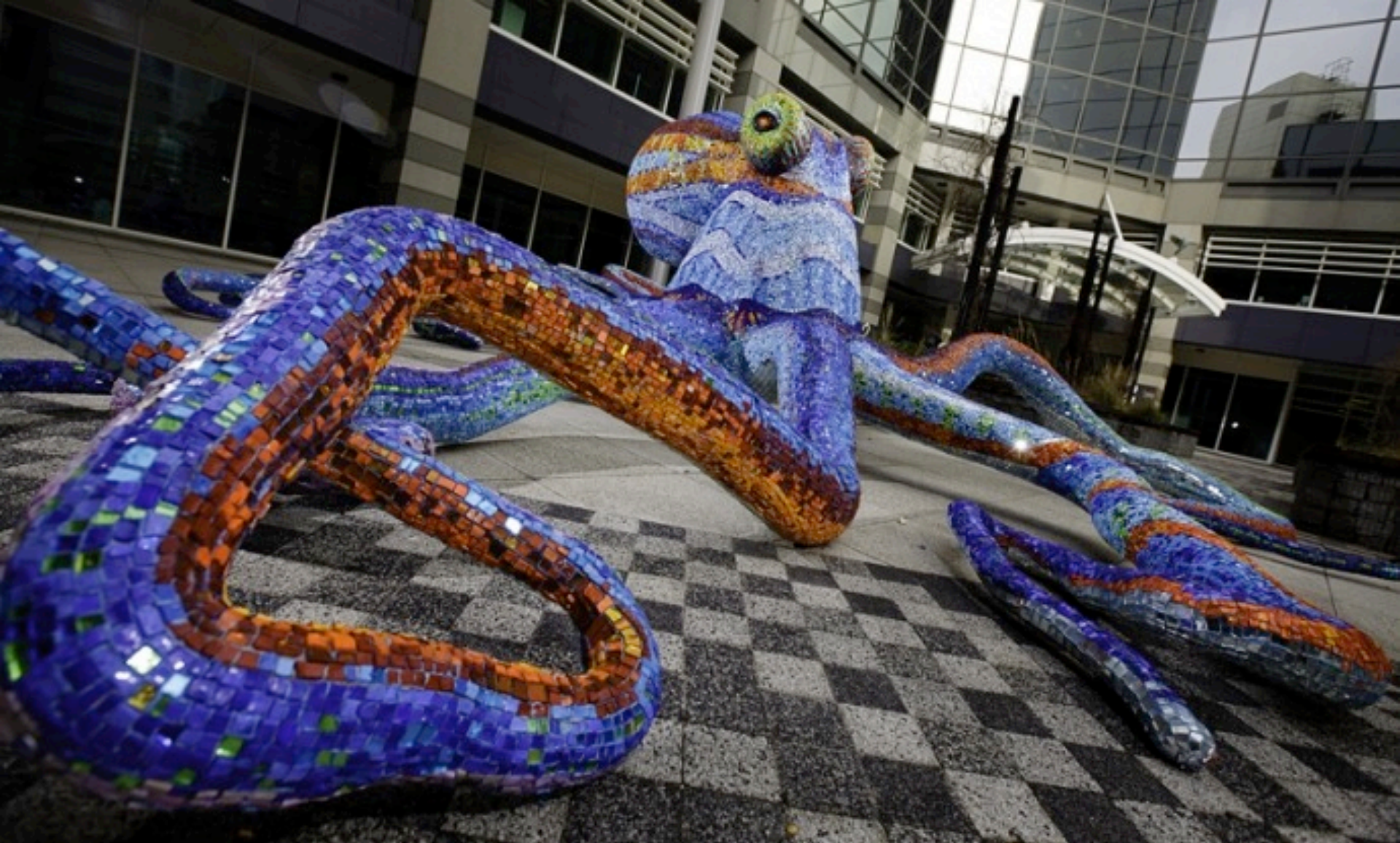
Octopus 560 x 540 x 156 cm Mosaic sculpture Thomas More Sq, London, E1 2008-2011