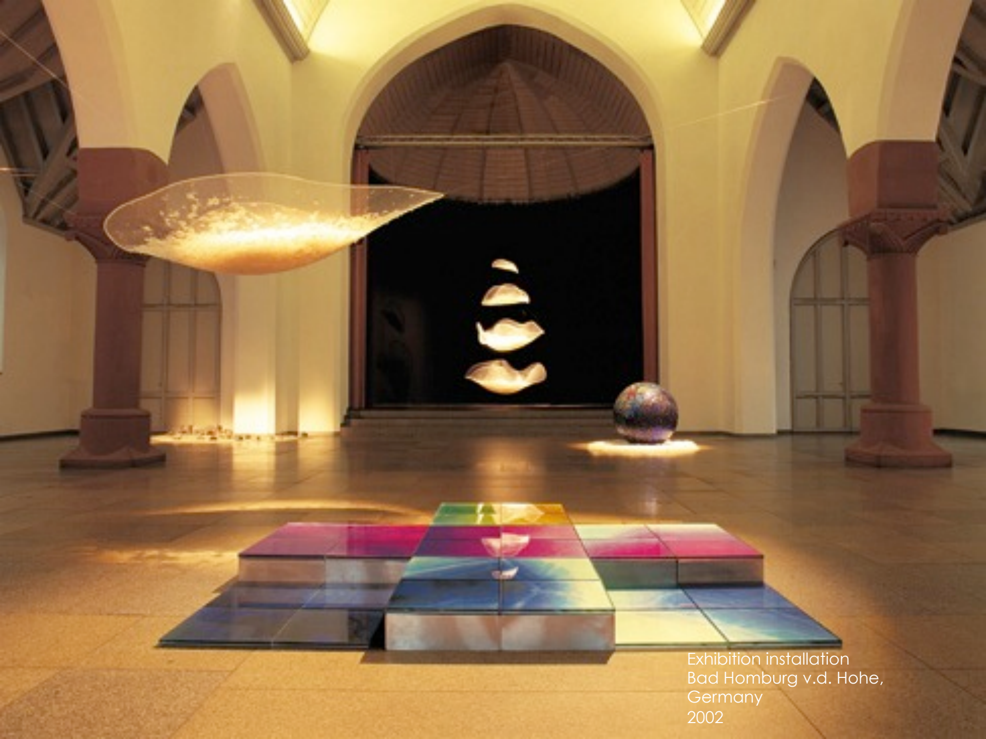
Exhibition installation Bad Homburg v.d. Höhe, Germany 2002