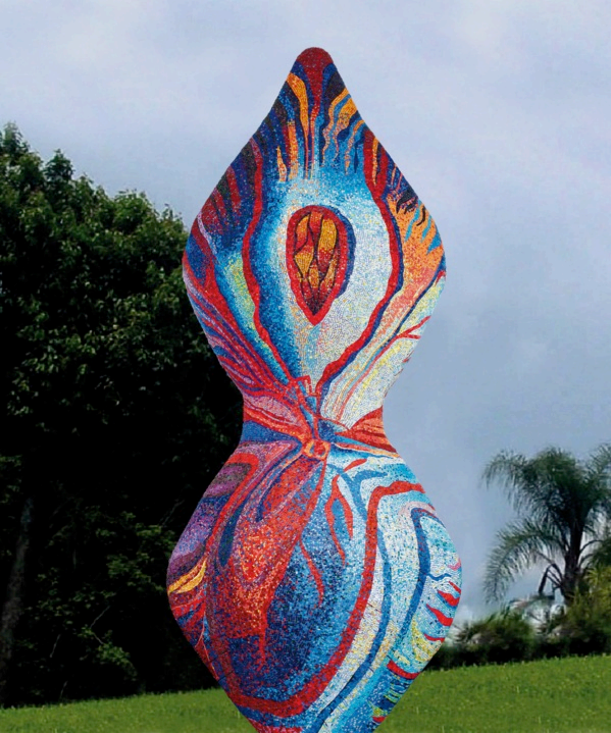
Woman from the Future 469 x 110 x 190 cm Mosaic, fiberglass and stainless steel Permanent installation at Coral Springs, FL, USA 2007 - 2009