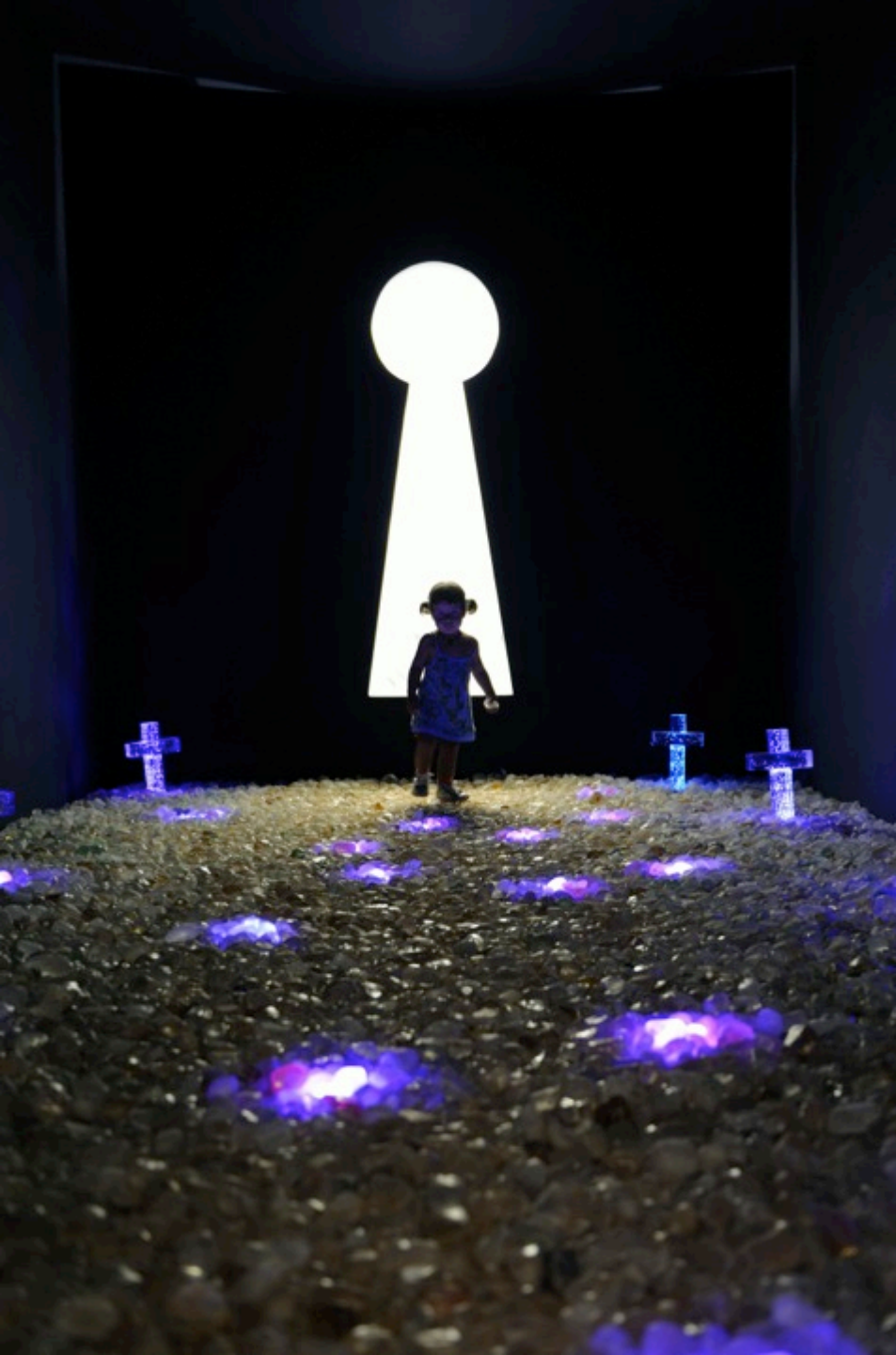
Follow the White Street of your Heart installation Mixed media 11 x 3 x 3 metres 2007