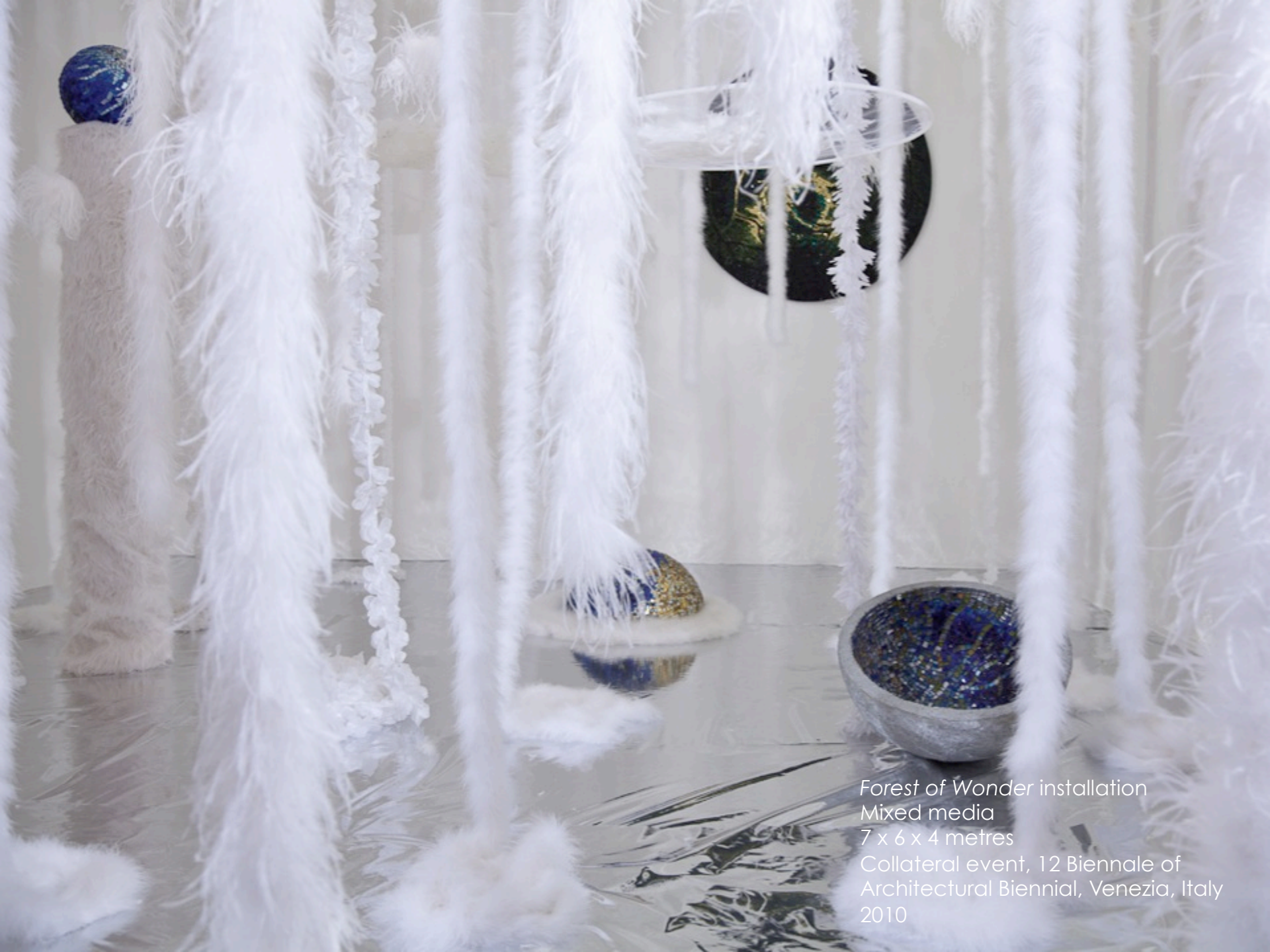
Forest of Wonder installation Mixed media 7 x 6 x 4 metres Collateral event, 12 Biennale of Architectural Biennial, Venezia, Italy 2010