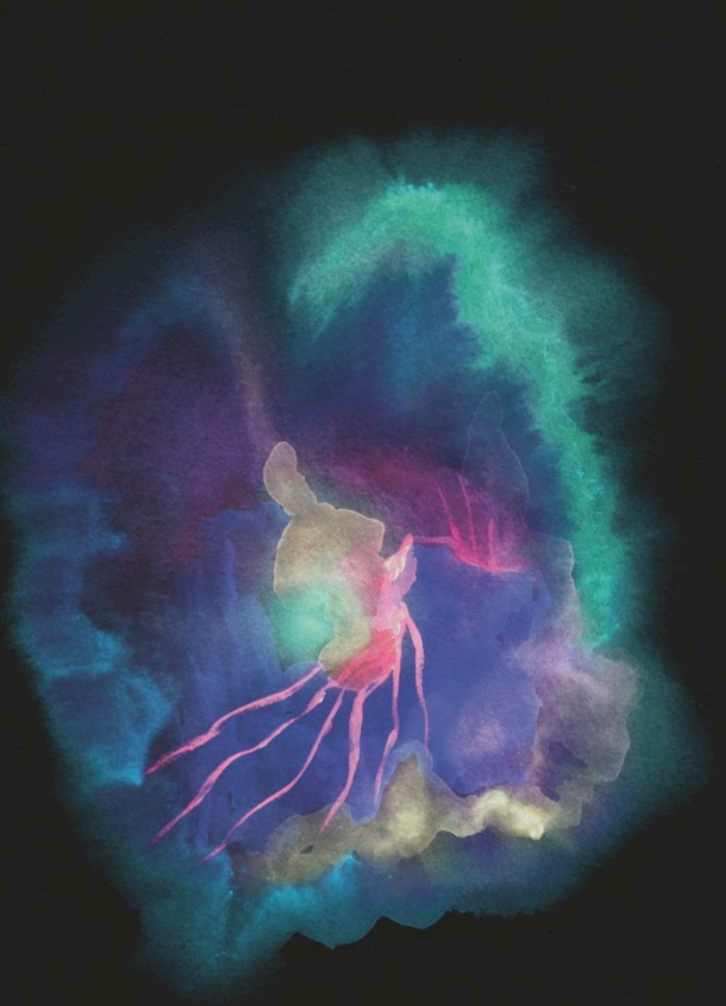
Jellyfish 180 x 130 x 2.5 cm Diassec under plexiglass 2010