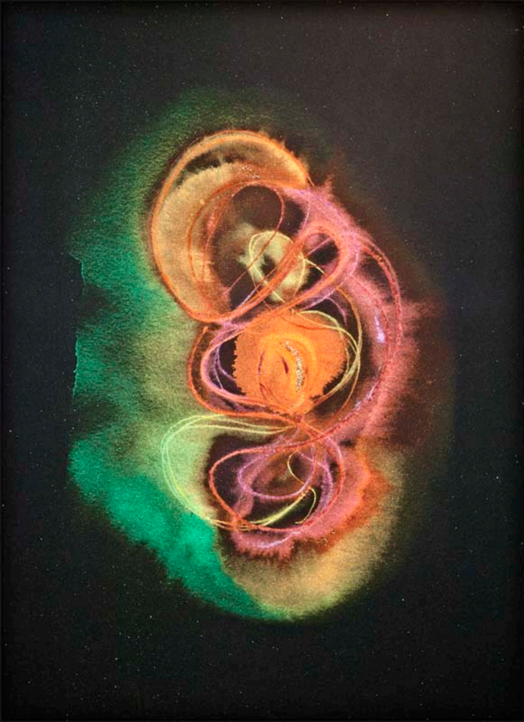
Vortice 134 x 184 x 6 cm Mixed media on canvas 2011