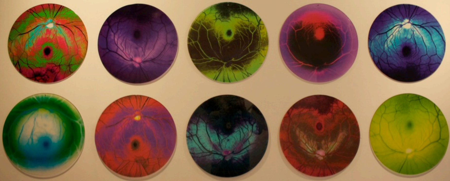
Oculus Dei 40 cm each diameter Acrylic on glass 2000