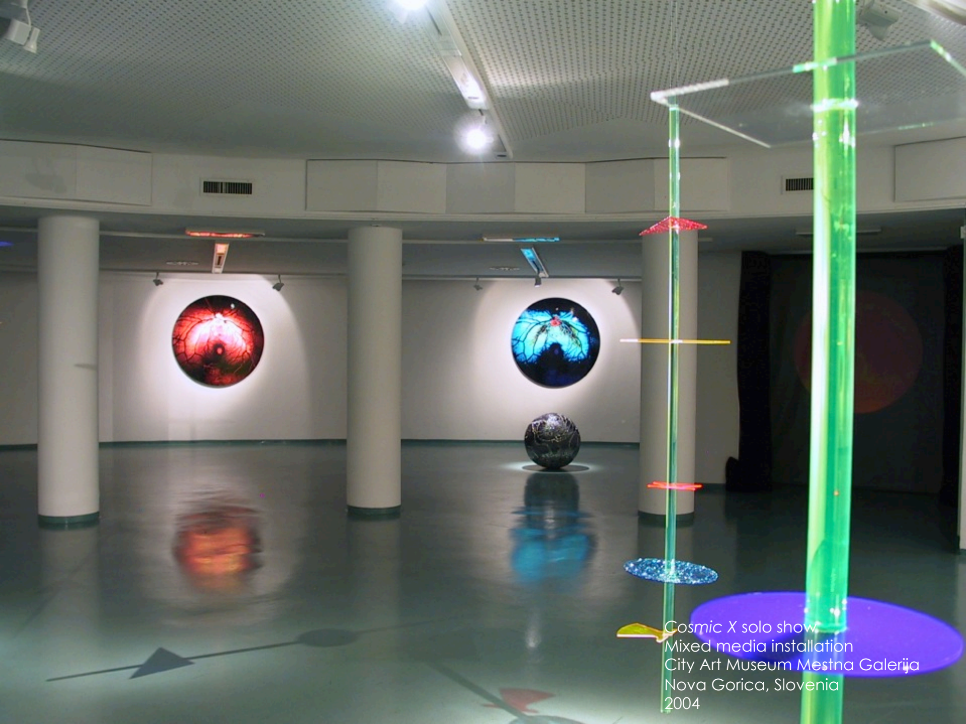
Cosmic X solo show Mixed media installation City Art Museum Mestna Galerija Nova Gorica, Slovenia 2004