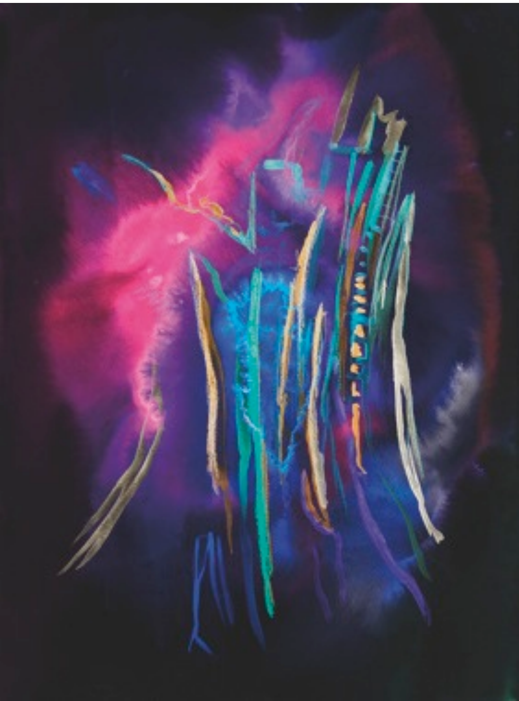
Flash 180 x 130 x 2.5 cm Diasac under plexiglass 2010