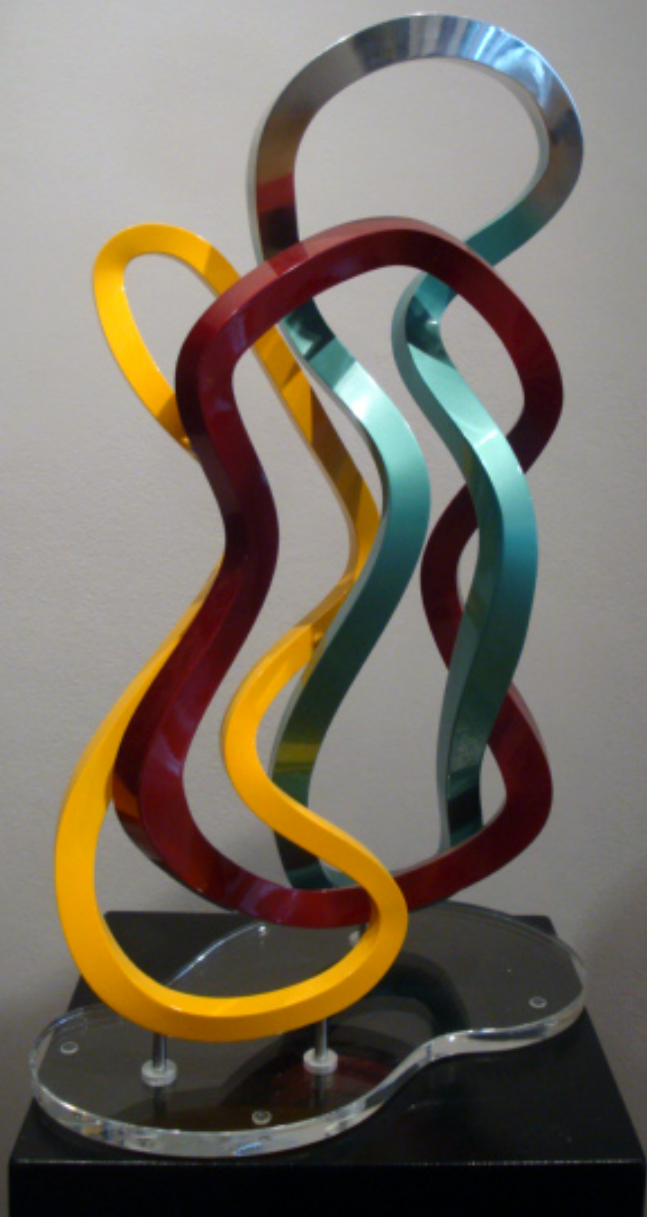
La Sapienza Creatrice 31 x 18 x 60 cm Aluminium 2006 - 2009