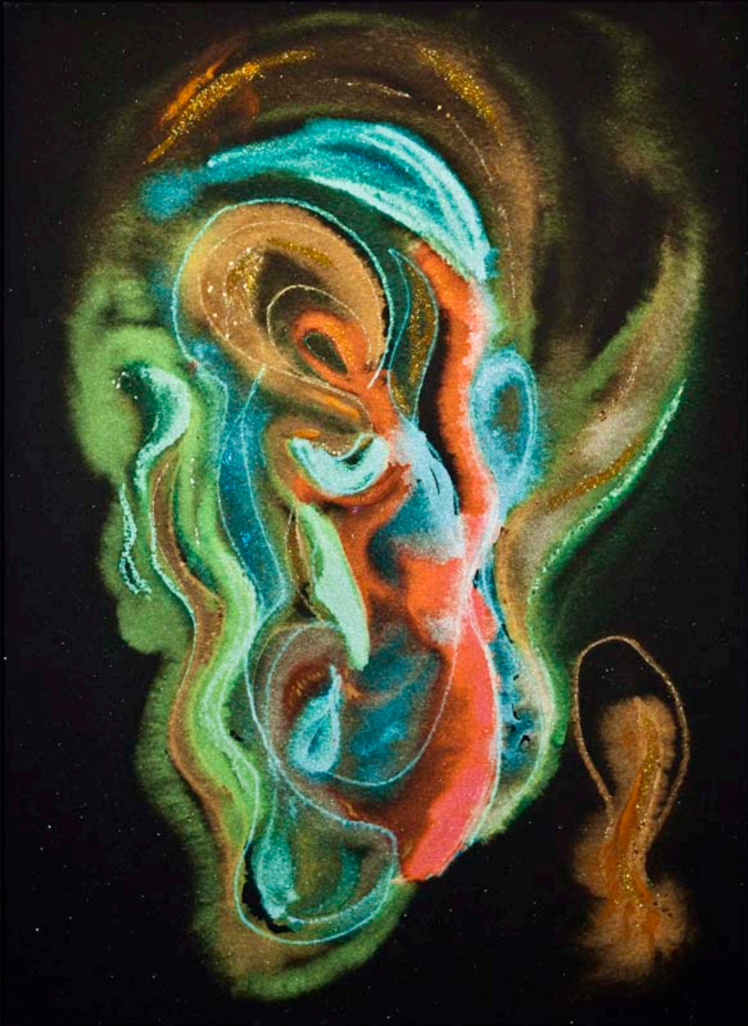
Maschera Rossa 134 x 184 x 6 cm Mixed media on canvas 2011