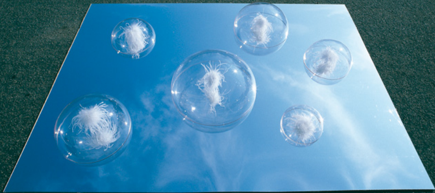
Garden on Mars 203 x 152 cm Perspex, glass and feathers 2004