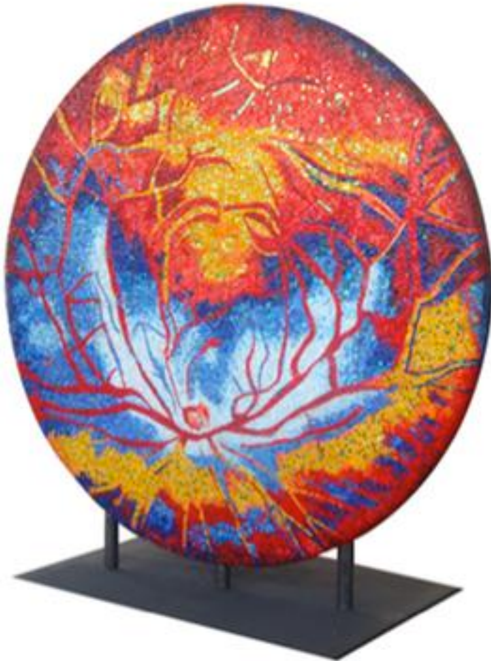
Night and Day 2.2 meter diameter Cardinal Place, London 2011